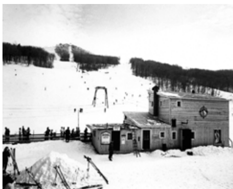
10. 16x20 - $32 8x10 - $16