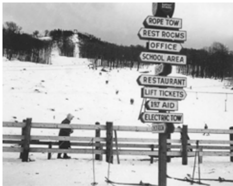
6. 16x20 - $32 8x10 - $16