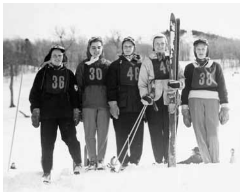
17. 16x20 - $32 8x10 - $16