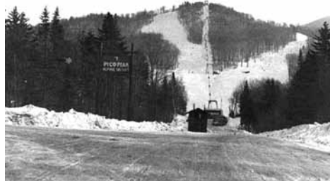
7. 16x20 - $32 8x10 - $16