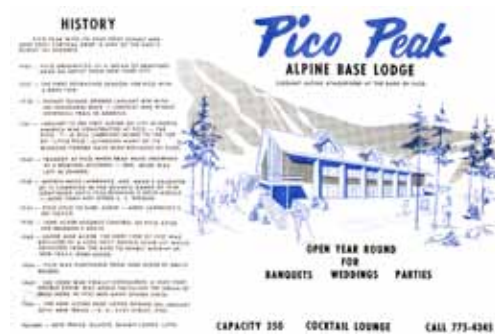
16. 18x24 - $36 24x36 - $60