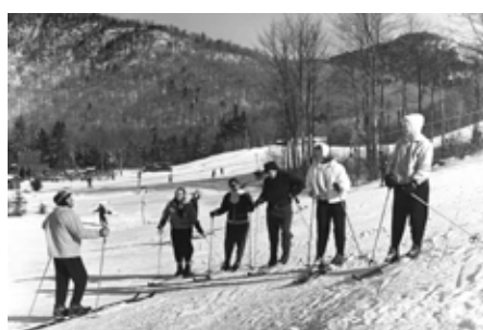
22. 18x24 - $36 24x36 - $60