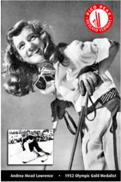
1. 18x24 - $36 24x36 - $60

(All proceeds benefit the youth skiing programs supported by PSEF)