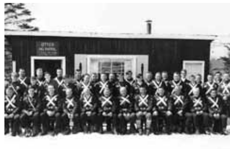
11. 18x24 - $36 24x36 - $60