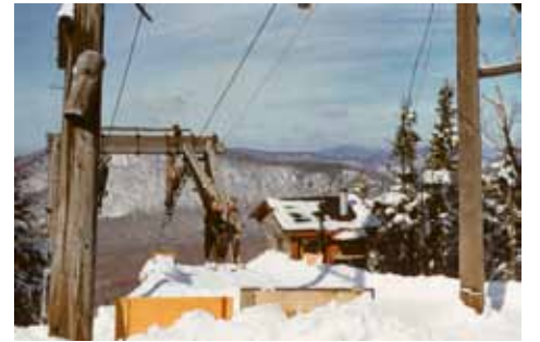
12. 18x24 - $36 24x36 - $60