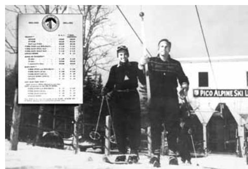
19. 18x24 - $36 24x36 - $60