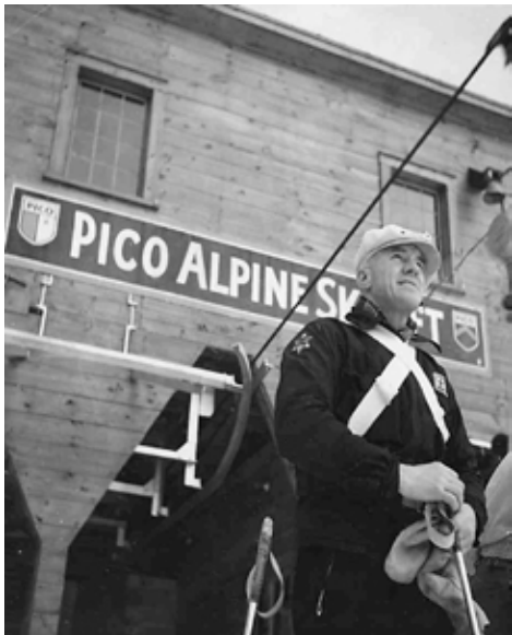
9. 16x20 - $32 8x10 - $16