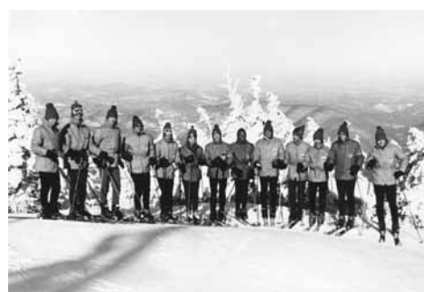
23. 18x24 - $36 24x36 - $60