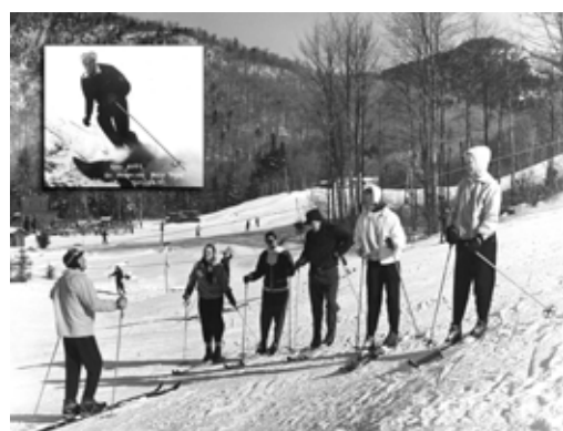
21. 18x24 - $36 24x36 - $60