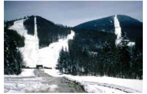
8. 18x24 - $36 24x36 - $60