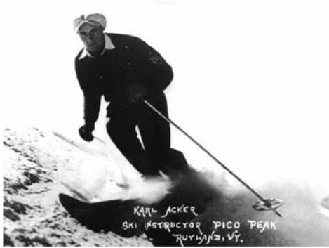
5. 16x20 - $32 8x10 - $16