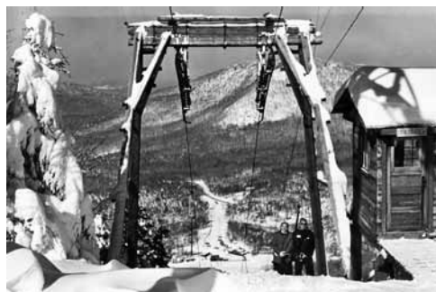
14. 18x24 - $36 24x36 - $60