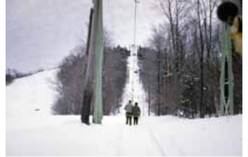
4. 16x20 - $32 24x36 - $60