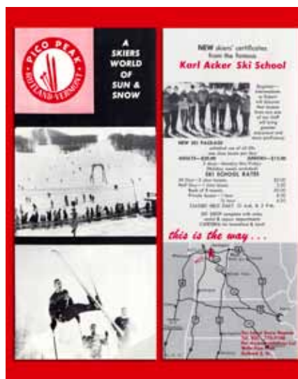
15. 18x24 - $36 24x36 - $60