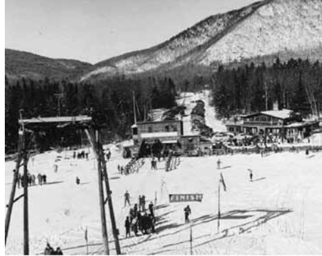
3. 16x20 - $32 8x10 - $16