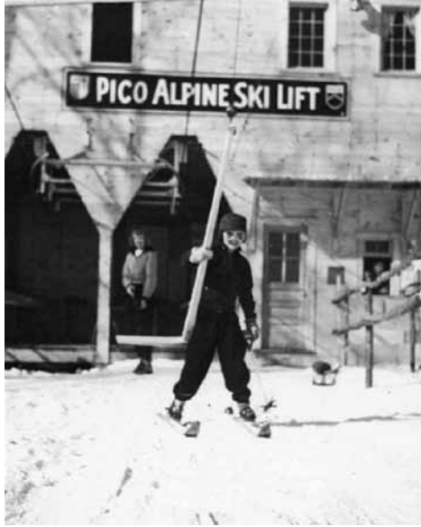
2. 16x20 - $32 8x10 - $16