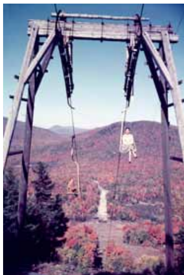
18. 18x24 - $36 24x36 - $60