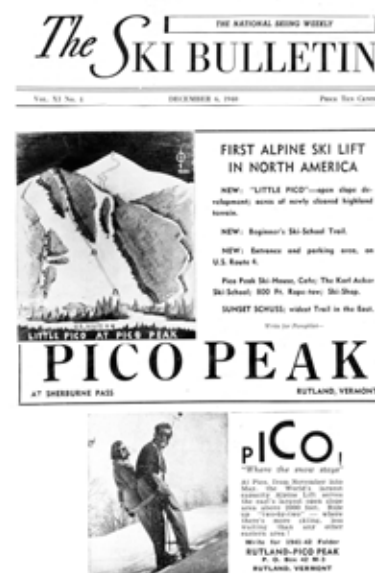
20. 18x24 - $36 24x36 - $60